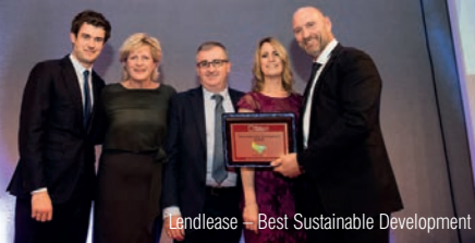
Lendlease – Best Sustainable Development