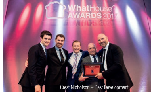
Crest Nicholson – Best Development

As well as details of the scheme built specifically for rent, entries should include a statement of management ethos, including customer care policies, focus on community vibe and any other supporting material relating to the functionality and design of the building that makes it worthy of winning an award in this exciting new category.