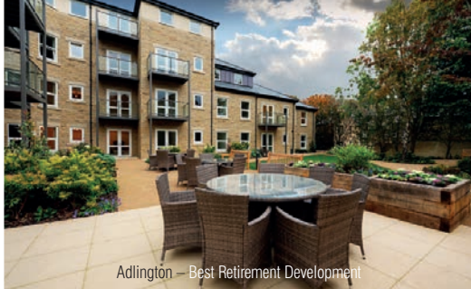
Adlington – Best Retirement Development