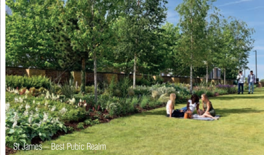
St James – Best Public Realm