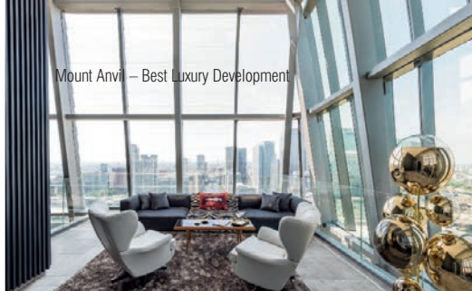
Mount Anvil – Best Luxury Development