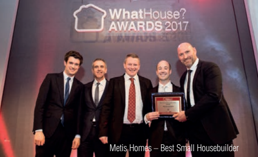
Metis Homes – Best Small Housebuilder